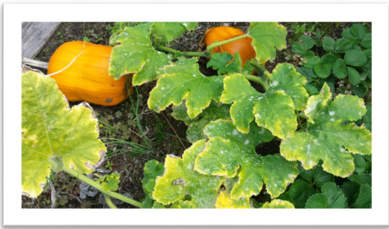
The pumpkins should be ready by Halloween!