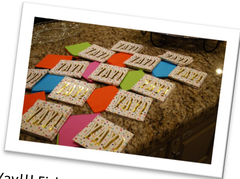
Yay!!! Fisher House is 8 years old!

“Fisher House gave me a feeling of security and being part of a happy family. “