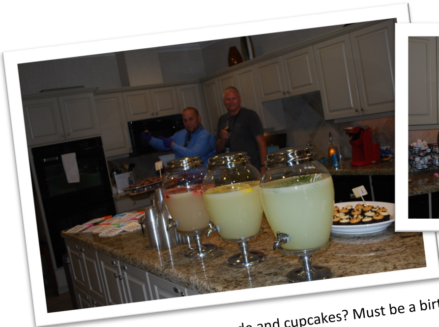
Lemonade and cupcakes? Must be a birthday party!

“Fisher House gave me a feeling of security and being part of a happy family. “